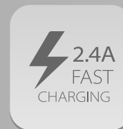
Fast Charging and Recharging Speed