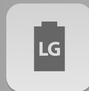
Superior LG Battery