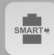
TP-LINK Smart Charging