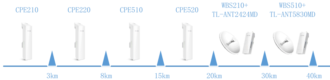
Figure 2.1 Range recommendations for each device in PtP connection