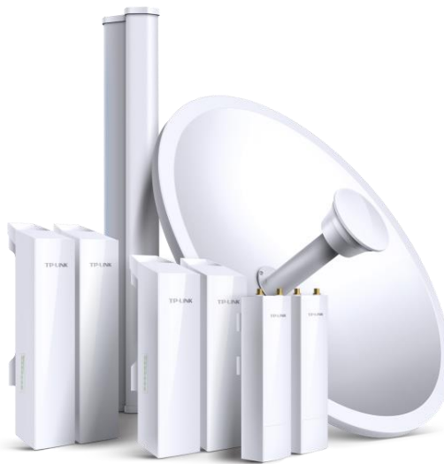
Figure 1 Pharos Overview

Pharos Series devices, including CPEs, wireless base stations, and antennas, are designed to provide effective solutions for fixed outdoor wireless communication. All Pharos devices feature 2X2 MIMO, which supports wireless speeds of up to 300Mbps and ensures optimal performance.