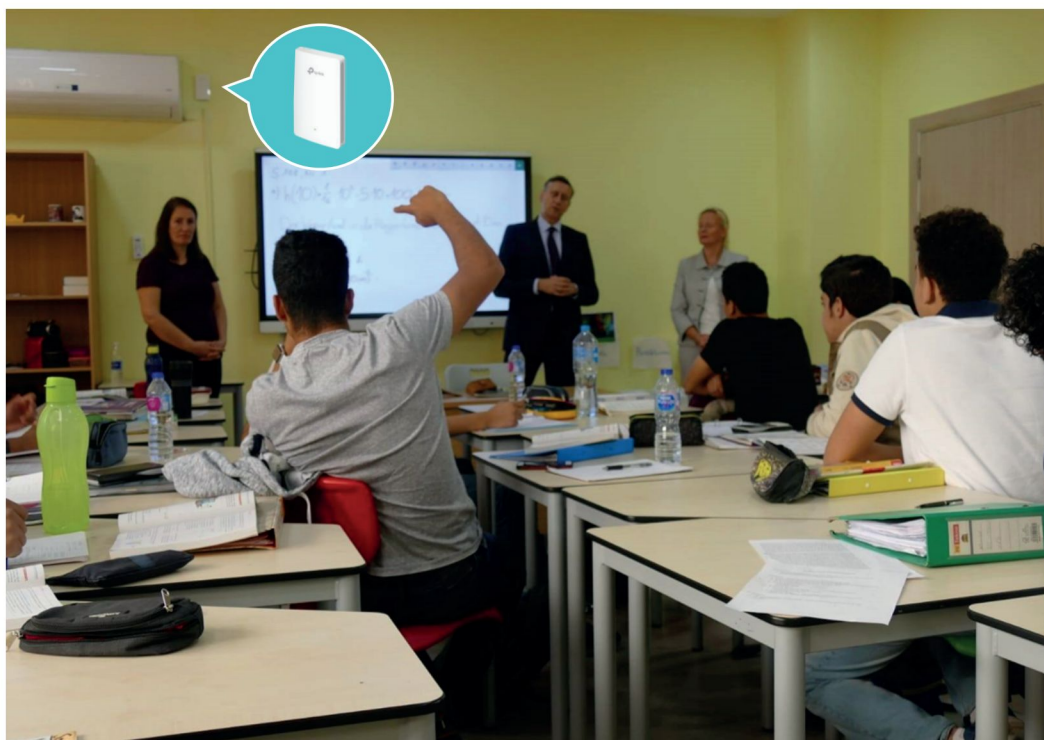
A photo from the place