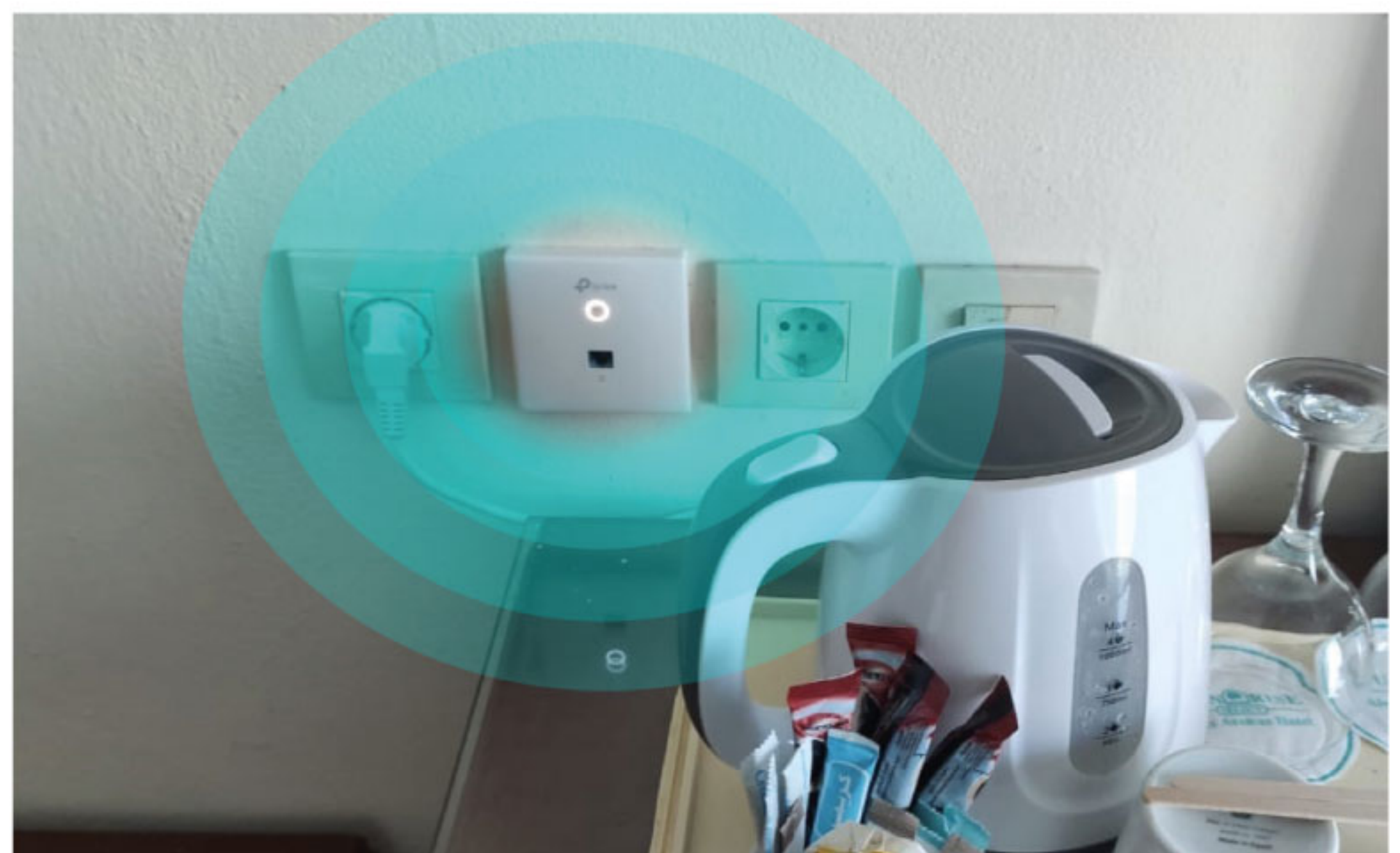
Real photo from the room