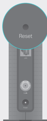
Reset Button Press & Hold for 5 seconds