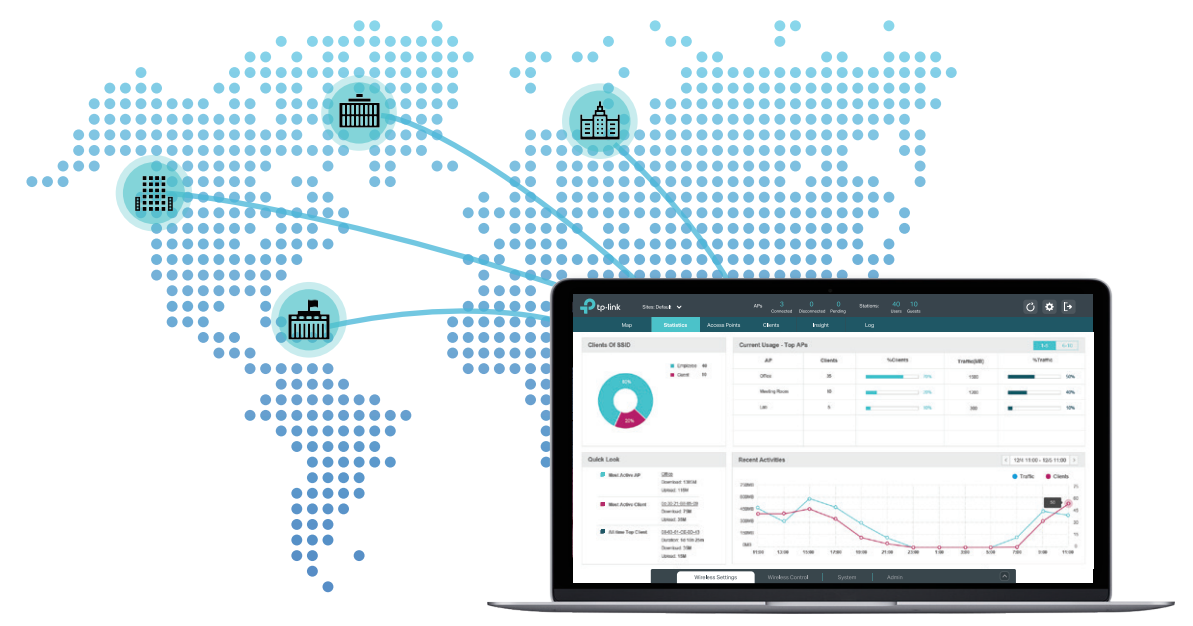
EAP Controller Software