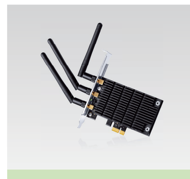
AC1750 Wireless Dual Band PCI Express Adapter Archer T8E