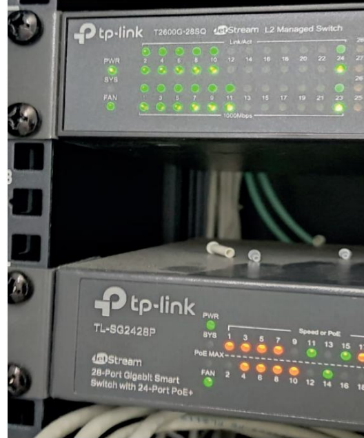
Real photo of switches rack