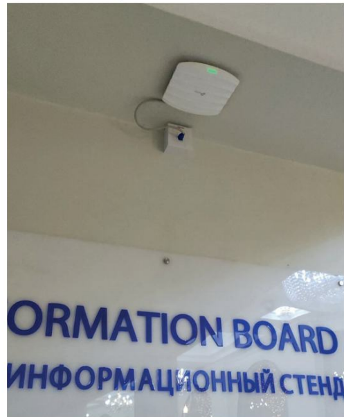
Real photo of restaurant