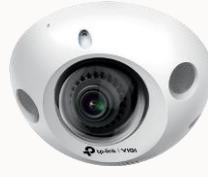
VIGI C230I Mini