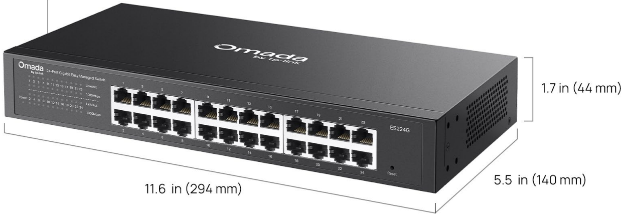
Desktop or Rackmount